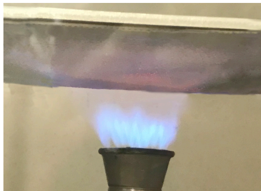
Flame test with Protexx-Shield® 7030

Protexx-Shield 7030 is constructed of multiple layers of materials including an innovative flame barrier technology that activates during a thermal runaway event to stop flame penetration while additional layers provide insulation. This unique construction ensures excellent protection against potential thermal runaway event.