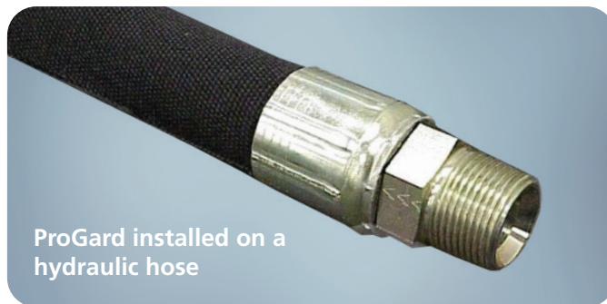
ProGard installed on a hydraulic hose

ProGard is used in a wide range of industries including hydraulics, mining, construction & agriculture.