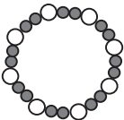
End view (enlarged diameter) of Expando® 686DM showing PEEK guard strands (larger) and PPS support strands (smaller, gray) in a typical configuration.