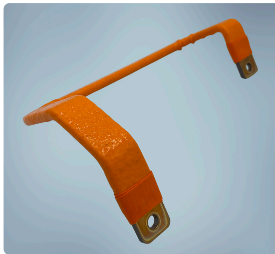
Silicone Tape 64R combined with FyreJacket® 1650 on a busbar.

Silicone Tape 64R is compatible with FyreJacket® products to provide thermal runaway protection to critical Electrical Systems within battery pack.